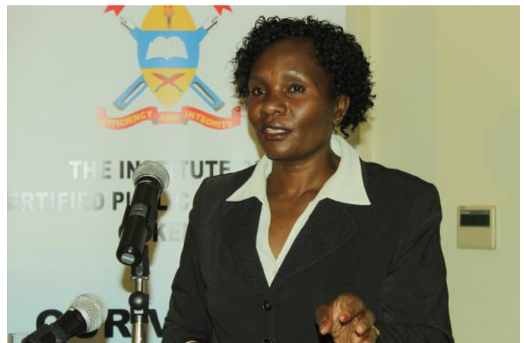
CS. Winfred Lichuma, EBS, Chairperson, National Gender and Equality Commission speaks during the Governance Forum

The 16 th ICPSK Governance Forum will be held on Wednesday, March 4, 2015 at 5.30 pm at the Sarova Panafric Hotel, Nairobi. The topic will be "Good Governance in Alternative Dispute Resolution: Is Arbitration an Effective Alternative to Litigation?" Charges are Ksh. 3,000 per person. Members attending will be allocated 2 CPD credits. Please make your bookings latest by Tuesday, March 3, 2015.