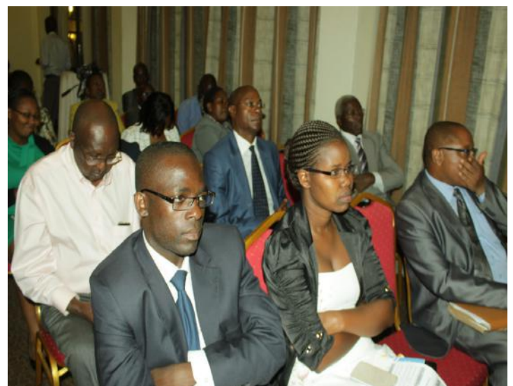
Members of the Institute during the Governance Forum