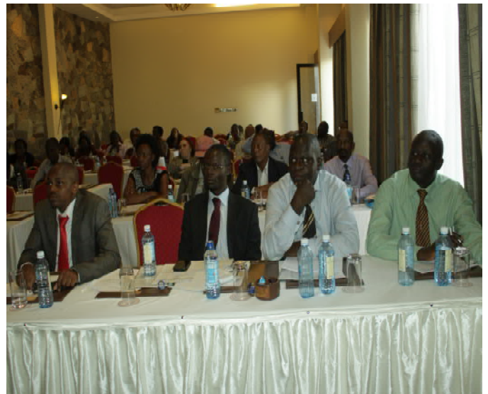
Members of the Institute during the 1 st CPS Practitioners Seminar